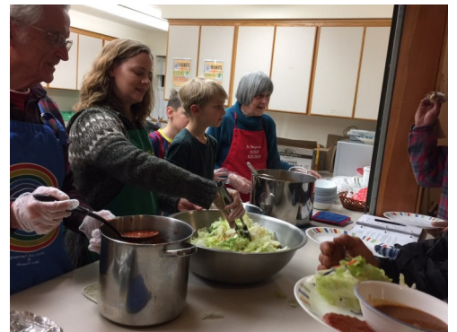
Serving the meal at St. Stephen's

Then, of course, there was clean-up and washing LOTS of dishes.